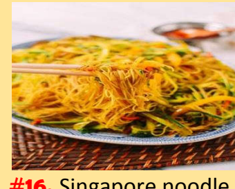
#16. Singapore noodle 星洲炒米