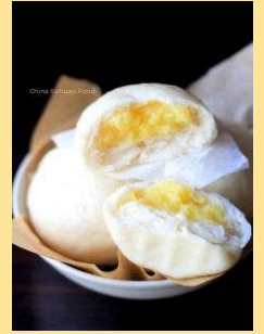
#38. Cream butter buns 奶黃包 (2 pcs)