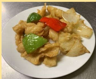
#4. Squids 炸鮮魷