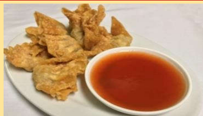
#31. Sweet & Sour deep-fried wontons 炸雲吞 (7 pcs)