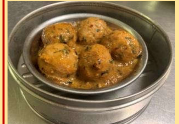
#20. Satay meat balls 沙爹豬肉丸