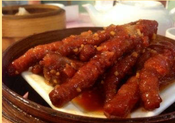
#29. Chicken feet 鳳爪