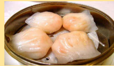
#9. Steamed shrimp dumplings 蝦餃 (4 pcs)