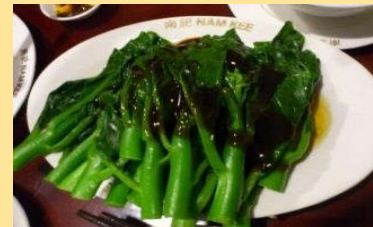
#15. Vegetable oyster sauce 油菜