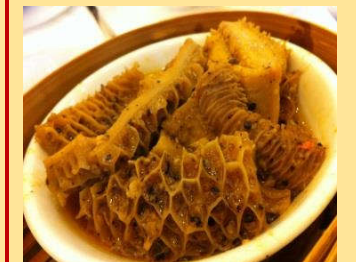
#22. Beef stomach 牛肚