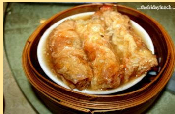
#28. Ginger pork rolls 鮮竹卷 (3 pcs)