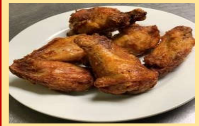
#19. Salt & pepper wings 椒鹽雞翼 (6 pcs)