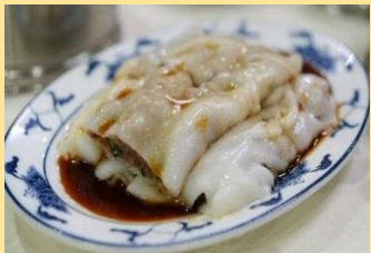
#3. Beef noodle roll 牛腸粉