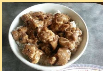
#7. Sparerib with white rice 排骨飯