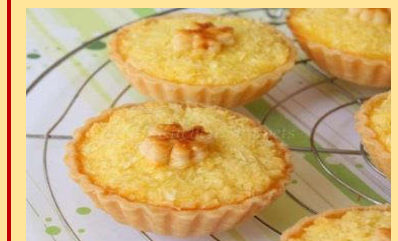
#42. Coconut pineapple tarts 椰撻 (3 pcs)