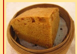
#35. Sponge cake 馬拉糕