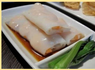
#1. Shrimp noodle roll 蝦腸