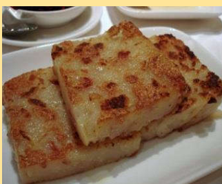
#27. Chinese radish cakes 籮白糕 (3 pcs)