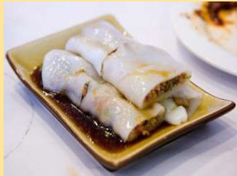
#2. B.B.Q pork noodle roll 叉燒腸