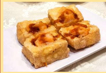
#13. Tofu 釀豆腐 (3 pcs)