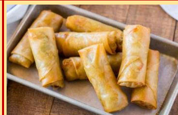
#36. Beef spring rolls 牛肉春卷 (3 pcs)