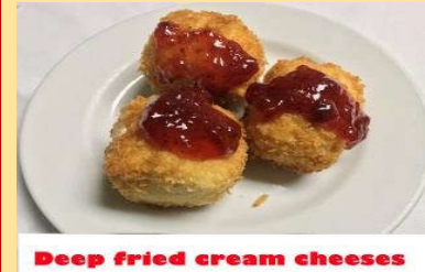
#14. Cream cheese 炸芝士 (3 pcs)