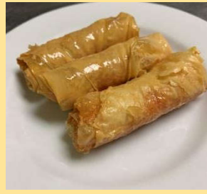
#10. Crispy seafood wraps 海鮮腐皮卷 (3 pcs)