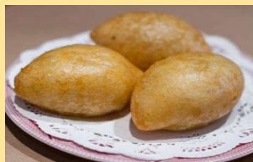
#30. Deep fried meat dumplings 咸水角 (3 pcs)