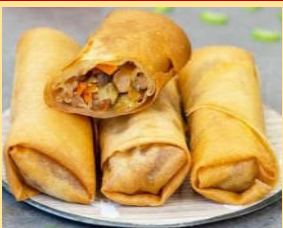
#26. Spring rolls 春卷 (3 pcs)