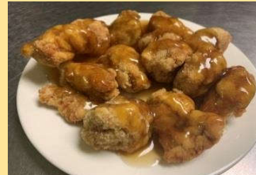
#8. Honey garlic pork kabobs 蒜子串豬