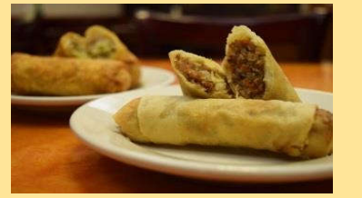
#40. Vietnamese spring rolls 越南春卷 (3 pcs)