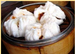
#25. B.B.Q pork buns 叉燒包 (2 pcs)