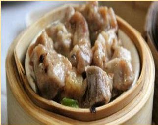
#24. Spareribs 排骨