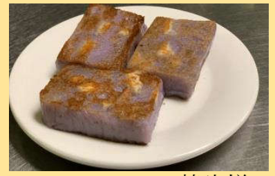
#39. Taro cakes 芋頭糕- 甜 (3 pcs)