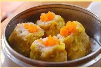
#23. Pork dumplings 燒賣 (4 pcs)