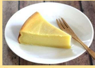
#33. Green bean cakes 綠豆糕 (3 pcs)