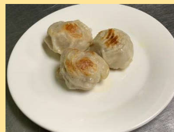
#32. Pan fried meat dumplings 鍋貼 (3 pcs)