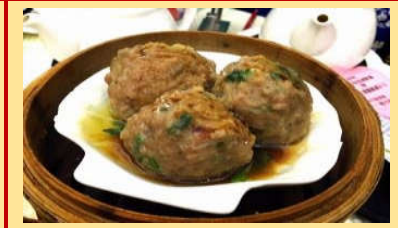
#41. Beef ball with bean curb wrap 山竹牛肉