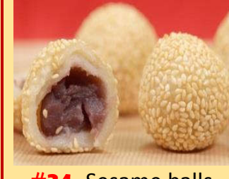
#34. Sesame balls 煎堆仔 (3 pcs)