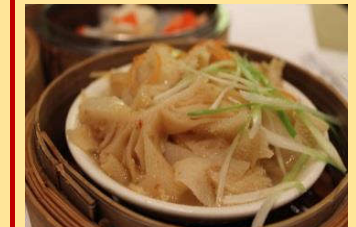
#21. Beef tripe 牛栢葉